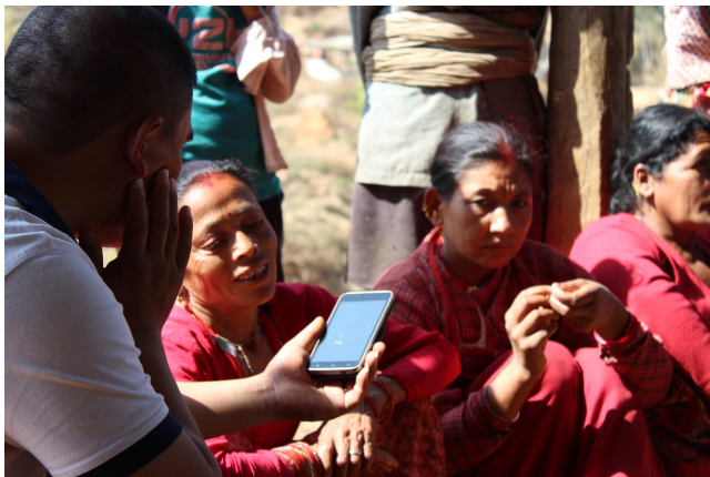
Figure 2: Smartphone Use during Community Meeting[14]

munication between CFAs and office staff. The apps reporting module is built around a Kobo Toolbox[5] backend, but uses Enketo webforms to display freeform reports which allows flexibility in the reporting instead of the strict progression enforced by other data collection tools. Kobo was selected in accordance with the criteria set out in [1] for mobile data gathering tools, but with the extra criteria of easy maintenance, higher emphasis on low-cost, and the extra criteria of external acceptance and data integration (The open-source Kobo Toolbox is supported by the United Nations with free hosting and allows sharing and queries across different data sources). An Announcement Module allows dissemination of guides and training to CFAs from the main office, whilst a Wiki Module allows CFAs to share their knowledge and experiences. Finally the application auto-generates additional meta-questions about the structure of each report with the aim of providing a mechanism where extra information in meetings can be gathered and priority mismatch can be identified. This final feature means that, in conjunction with organizational practices that encourages it, the opportunity for inspection and adaptation of the work increases.